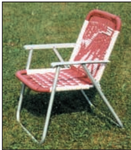
Figure 1—Before: The humble lawn chair, soon to be transformed.