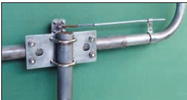
Figure 3—Gamma tuning assembly and mounting system. Two \frac{1}{2} inch holes are drilled through the aluminum mounting plate to clear the screw heads when the antenna is in the vertical plane.