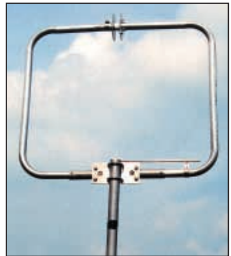
Figure 2—After: The 6 meter squalo, ready for action.